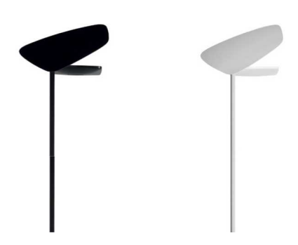
Brightness light direct up light